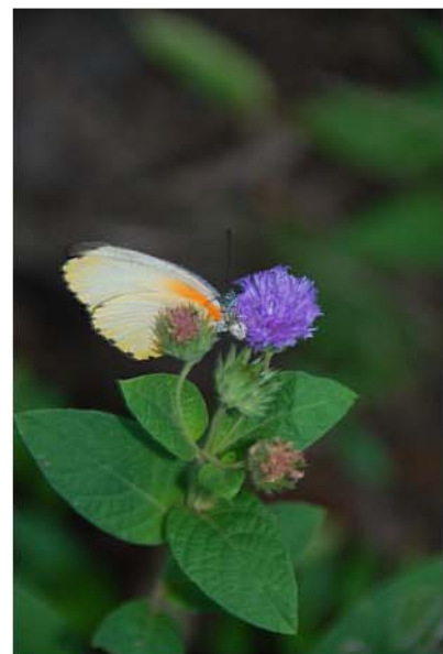
Vernonia sp. Buffer zone of Chimanimani reserve, in and around Mahate camp; E 33.19065242,-19.67441750, alt 500 m. The butterfly is dead and being eaten by a spider