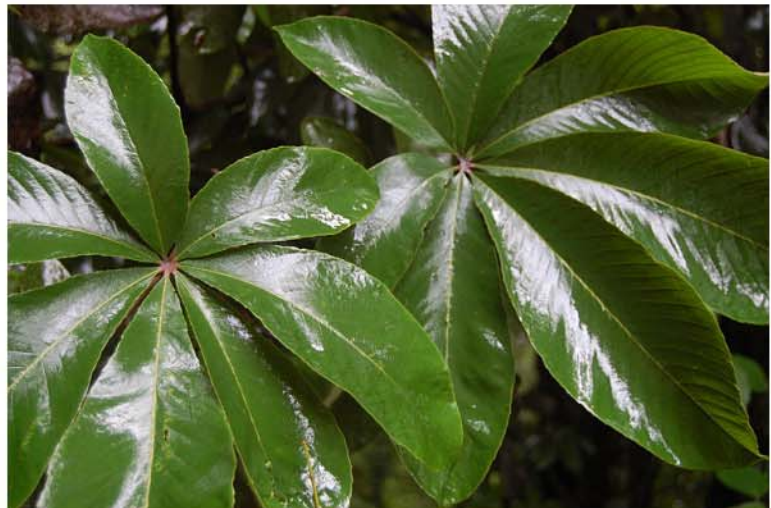
Myrianthus holstii Engl. Mt Tsetsera, in rainforest along road going up the mountain, E 32.83826250, S 19.38556472; UTM36-WGS84 483016.719,7856501.813; alt 1550 m.

Chimanimani Conservation Area