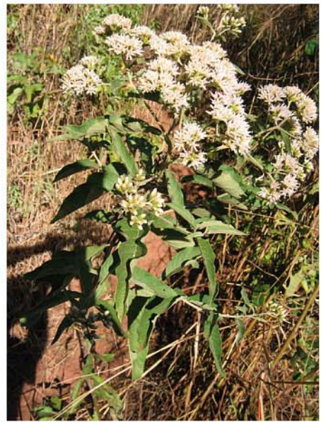
Vernonia amygdalina (or V. colorata ?) on track going up Mt Garuso, fallow fields/deforested area; E 33.16, S 18.97, alt 900 m