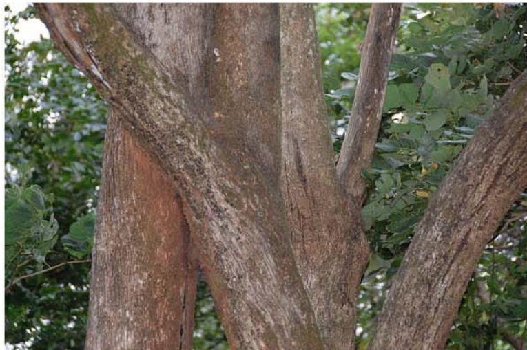
Cordia africana Lam. Moribane forest; along main road, E 33.35398499, S 19.69402498; UTM36-WGS84 537099.885,7822338.687; alt 600 m