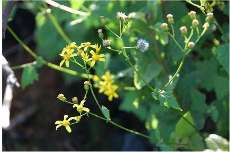
Senecio deltoideus Less. Mt Tsetsera, in grassland, E 32.84042651, S 19.39965706; UTM36-WGS84 483245.394,7854942.666; alt 1950 m