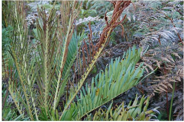
Blechnum tabulare (Thunb.) Kuhn Chimanimani mountains, Nhamadimo - Massase plateau, quartzite grassland and bolders; E 33.09455838, S 19.72711295, alt 1750 m