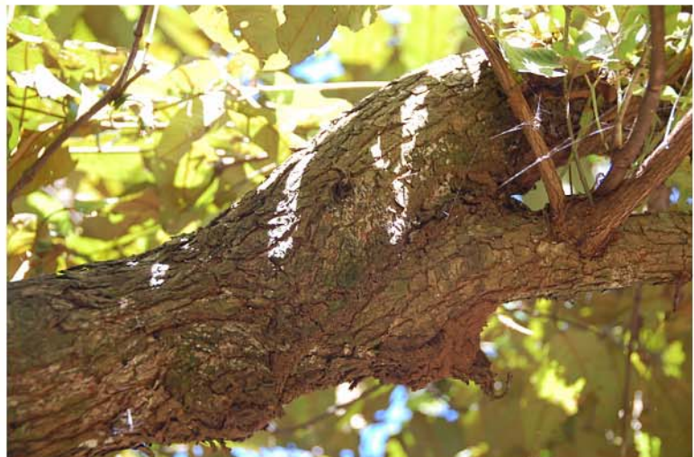
Harungana madagascariensis Lam. ex Poiret Moribane forest, Mpunga camp, along the main road; E 33.35608683, S 19.74357478; UTM36-WGS84 537308.675,7816855.135; alt 500 m