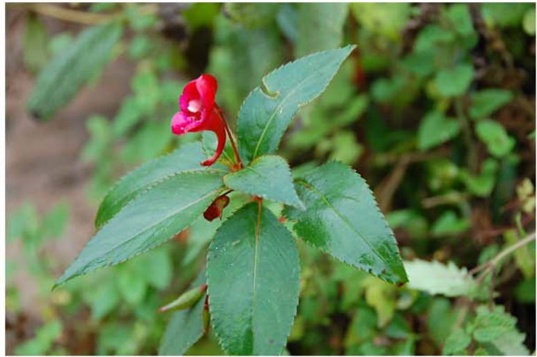
Impatiens salpinx Schultze & Launert Chimanimani mountain range, in Gashwa mountain rainforest and canyon, at margin of forest and river; E 33.08707851, S 19.83755290, alt 1450 m