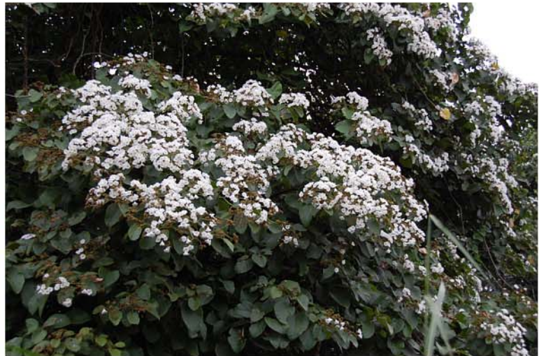
Cordia africana Lam. Moribane forest; along main road, E 33.35398499, S 19.69402498; UTM36-WGS84 537099.885,7822338.687; alt 600 m