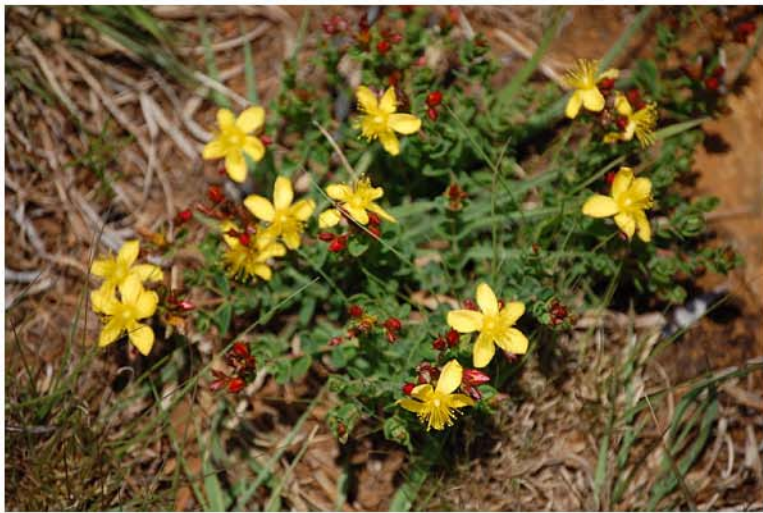
Hypericum aethiopicum Thunb. Mt Tsetsera, grasslands towards the top of the plateau, E 32.79926601, S 19.38158055; UTM36-WGS84 478921.359,7856938.374; alt 2200 m