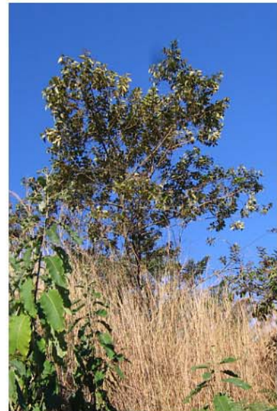
Harungana madagascariensis Lam. ex Poiret along track going up Mt Garuso, fallow fields/deforested area; E 33.16453734, S18.95753236; UTM-36-WGS84 517321.945,7903863.408, alt 900 m