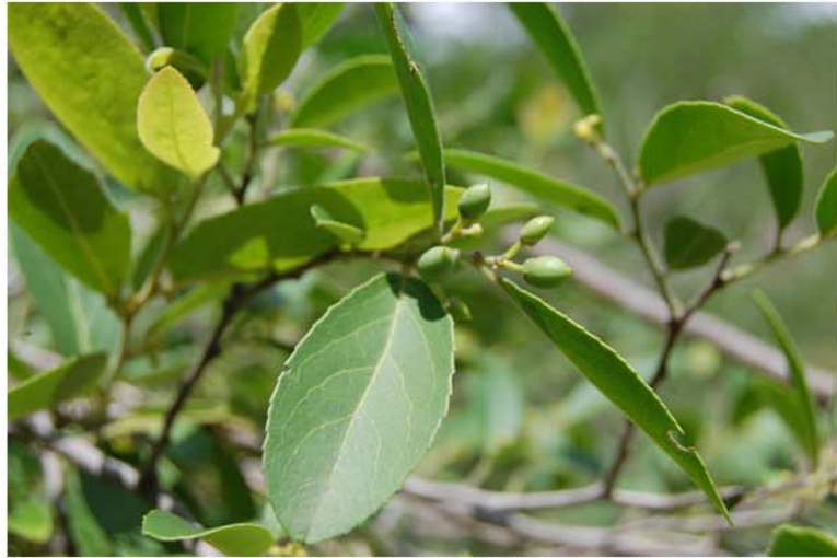
Mystroxylon aethiopicum Loes. (?) Chimanimani conservation area, miombo woodland vegetation in woodland close to the Mussapa pequeno river at the "portão"; E 33.08467816, S 19.58420245; UTM36-WGS84 508880.806,7834527.580; alt 600 m.