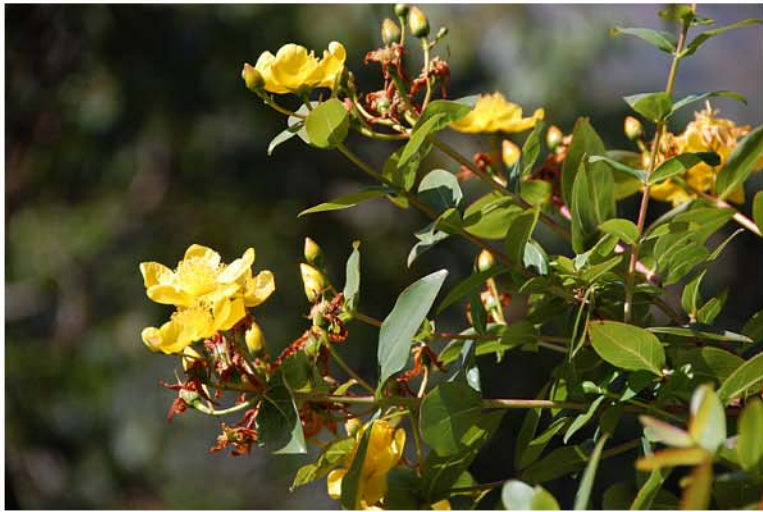
Hypericum roeperianum Schimp. ex A. Rich. Mt Tsetsera, brqcken vegetation along road going up, E 32.83964282, S 19.39120212; UTM36-WGS84 483162.239,7855878.155; alt 1700 m