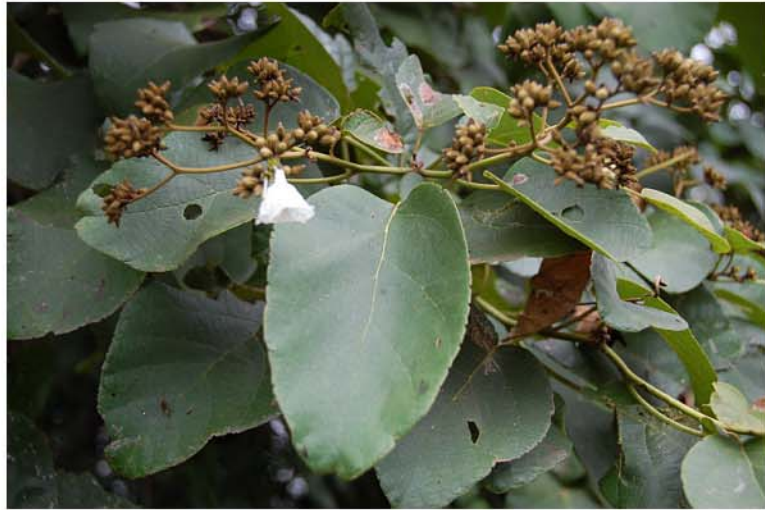
Cordia africana Lam. Moribane forest; along main road, E 33.35398499, S 19.69402498; UTM36-WGS84 537099.885,7822338.687; alt 600 m