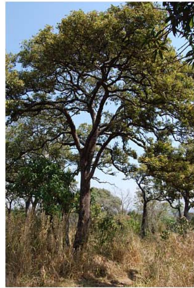
Parinaria curatellifolia Planchon ex Benth. Machote, north east of Moribane forest, woodland and margin of fields, E 33.40975961, S 19.60622499; UTM36-WGS84 542968.858,7832041.318; alt 550 m