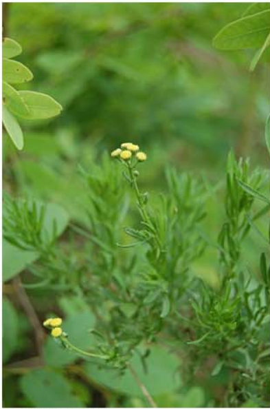
Schistostephium artemisifolium Baker Chimanimani conservation area, miombo woodland vegetation in woodland close to the Mussapa pequeno river at the "portão"; E 33.08467816, S 19.58420245; UTM36-WGS84 508880.806,7834527.580; alt 600 m.