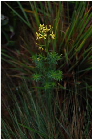
Senecio sp. Mt Tsetsera, grassland, E 32.84062505, S 19.39909362; UTM36-WGS84 483266.182,7855005.032; alt 1950 m.