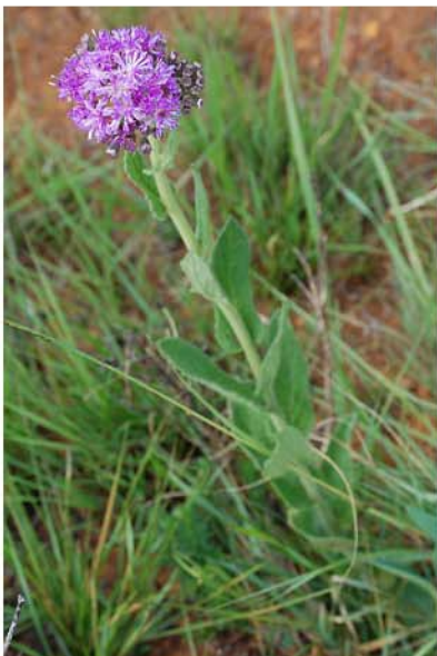
Senecio purpureus L. (?) Mt Tsetsera, grasslands towards the top of the plateau, E 32.79926601, S 19.38158055; UTM36-WGS84 478921.359,7856938.374; alt 2200 m