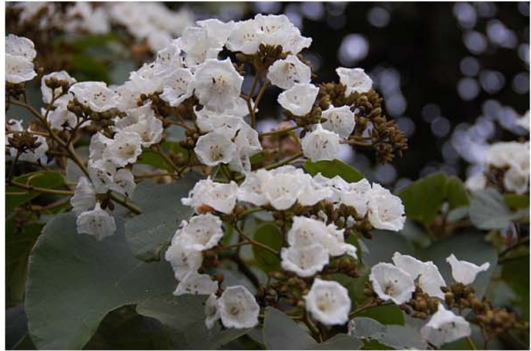
Cordia africana Lam. Moribane forest; along main road, E 33.35398499, S 19.69402498; UTM36-WGS84 537099.885,7822338.687; alt 600 m