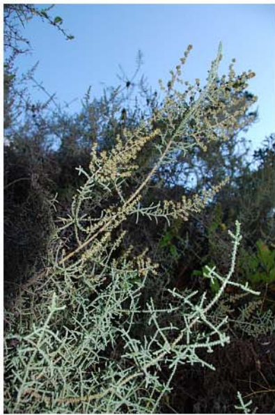
Stoebe vulgaris Levyns Mt Tsetsera in mountain rainforest; E 32.83646870, S 19.39758695; UTM36-WGS84 482829.621,7855171.341; alt 1900 m.