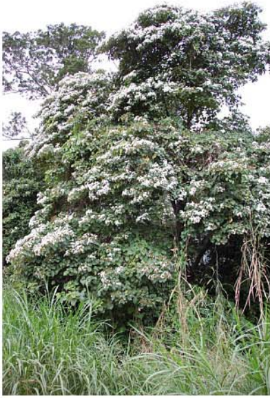
Cordia africana Lam. Moribane forest; along main road, E 33.35398499, S 19.69402498; UTM36-WGS84 537099.885,7822338.687; alt 600 m