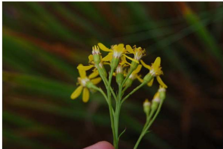
Senecio sp. Mt Tsetsera, grassland, E 32.84062505, S 19.39909362; UTM36-WGS84 483266.182,7855005.032; alt 1950 m.