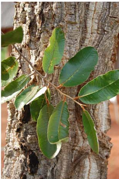
Parinari curatellifolia Planch. ex Benth. Chimanimani mountains, in Chikukwa camp; E 32.97049649, S 19.71545629, alt 1000 m.