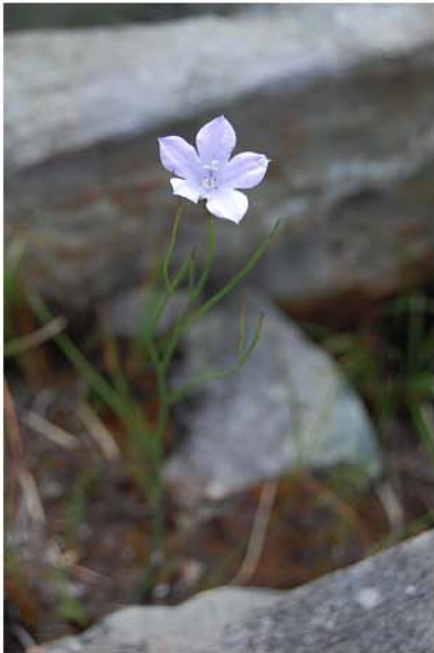
Wahlenbergia undulata (L.f.) A.DC. Mt Tsetsera, grasslands towards the top of the plateau, E 32.79926601, S 19.38158055; UTM36-WGS84 478921.359,7856938.374; alt 2200 m