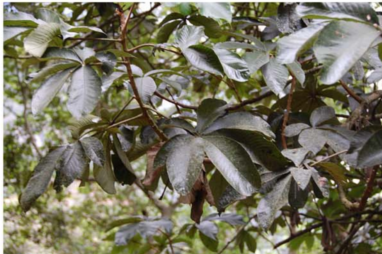
Myrianthus holstii Engl. Mt Tsetsera, mountain rainforest, along road going up the mountain. E 32.83786654, S 19.38556437; UTM36-WGS84 482975.142,7856501.813; alt 1550 m

Chimanimani Conservation Area - S Dondeyne 2009 (c)