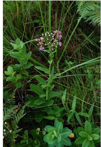
Senecio purpureus L. Mt Tsetsera, grassland, E 32.84062505, S 19.39909362; UTM36-WGS84 483266.182,7855005.032; alt 1950 m.