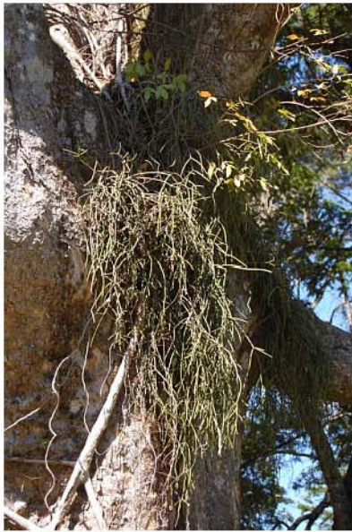
Rhipsalis baccifera (J. Mill.) W.T. Stearn Chimanimani mountains, along path going from Chikukwa camp to Muhoa waterfall, in riverine forest along Mussapa; E 32.97, S 19.71, alt 1000 m.