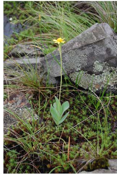
Senecio ruwenzoriensis S. Moore Mt Tsetsera, grassland, E 32.84062505, S 19.39909362; UTM36-WGS84 483266.182,7855005.032; alt 1950 m.