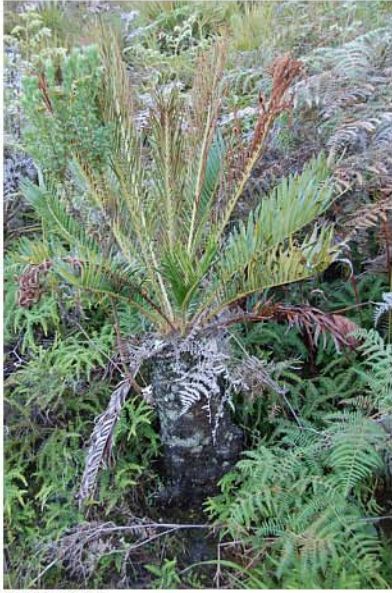
Blechnum tabulare (Thunb.) Kuhn Chimanimani mountains, Nhamadimo - Massase plateau, quartzite grassland and bolders; E 33.09455838, S 19.72711295, alt 1750 m