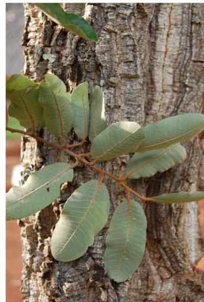
Parinari curatellifolia Planch. ex Benth. Chimanimani mountains, in Chikukwa camp; E 32.97049649, S 19.71545629, alt 1000 m.