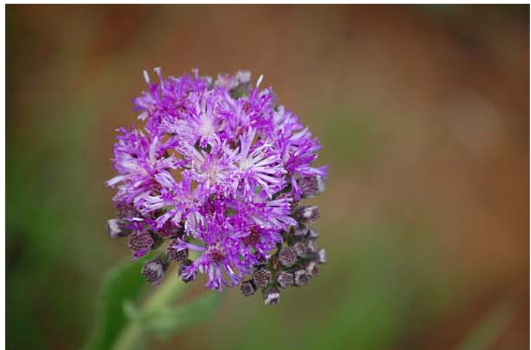
Senecio purpureus L. (?) Mt Tsetsera, grasslands towards the top of the plateau, E 32.79926601, S 19.38158055; UTM36-WGS84 478921.359,7856938.374; alt 2200 m