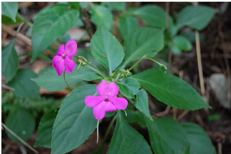
Impatiens wallerana Hook.f. Moribane forest, undergrowth along small stream; E 33.32381850, S 19.72920297 (proxi); UTM36-WGS84, 533930.796,7818452.270 alt 550 m