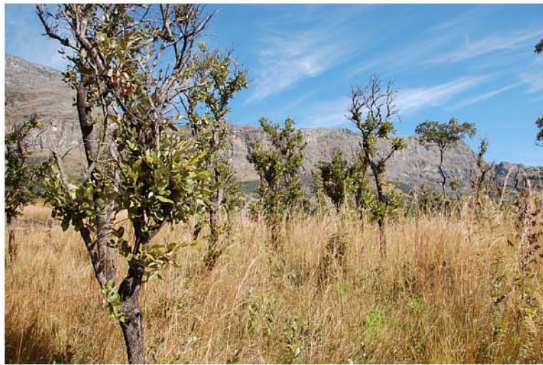
Parinaria curatellifolia Planchon ex Benth. Chimanimani mountains, along Nhamadzi river, around second time crossing the river; E 33.06, S 19.75m qlt; 1300 m