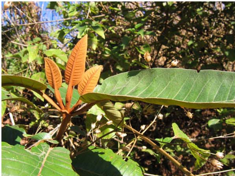
Harungana madagascariensis Lam. ex Poiret along track going up Mt Garuso, fallow fields/deforested area; E 33.16453734, S18.95753236; UTM-36-WGS84 517321.945,7903863.408, alt 900 m