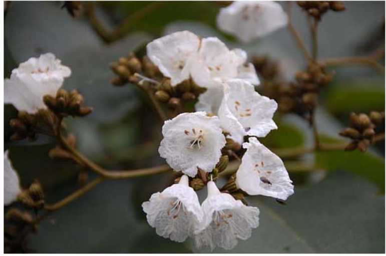
Cordia africana Lam. Moribane forest; along main road, E 33.35398499, S 19.69402498; UTM36-WGS84 537099.885,7822338.687; alt 600 m