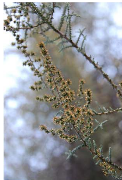
Stoebe vulgaris Levyns Mt Tsetsera in mountain rainforest; E 32.83646870, S 19.39758695; UTM36-WGS84 482829.621,7855171.341; alt 1900 m.