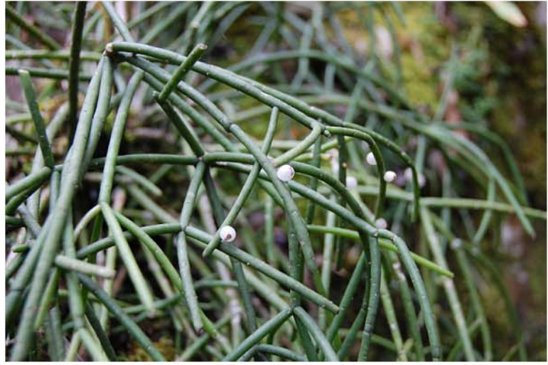
Rhipsalis baccifera (J. Mill.) W.T. Stearn Chimanimani mountains (Zimbabwe), gallery mountain rainforest close to (and north of) mountain hut; E 33.01864961, -19.78261579; UTM36-WGS84 501953.511,7812574.029; alt 1700 m