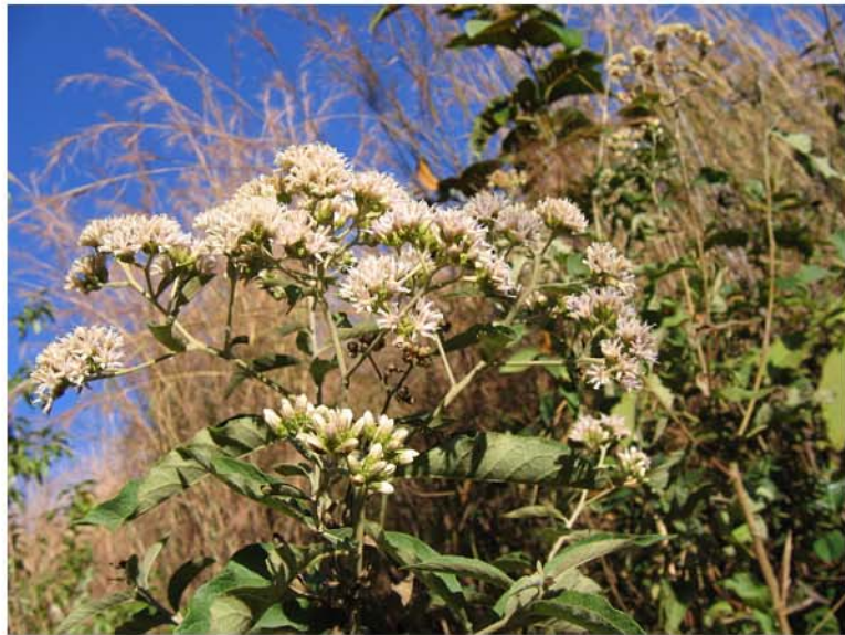
Vernonia amygdalina (or V. colorata ?) on track going up Mt Garuso, fallow fields/deforested area; E 33.16, S 18.97, alt 900 m