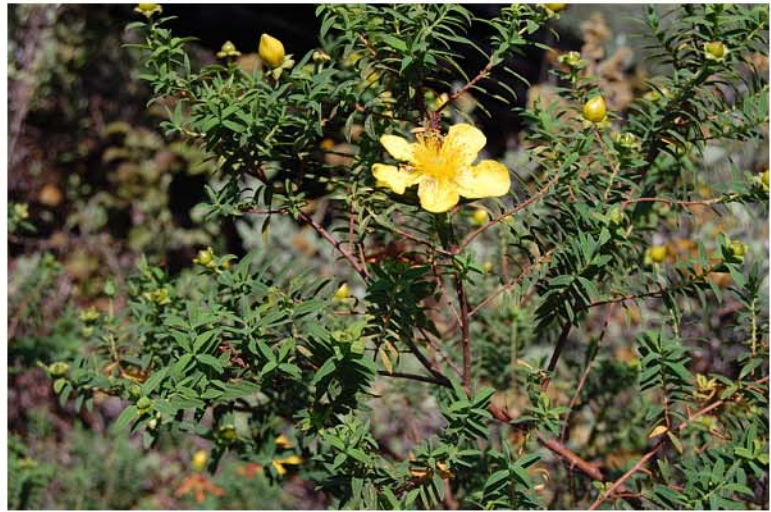
Hypericum revolutum Vahl Mt Tsetsera, forest around de Carvalhos mansion, E 32.81389603, S 19.39906822; UTM36-WGS-84 480459.718,7855005.032; alt 2000 m.