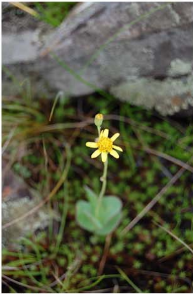
Senecio ruwenzoriensis S. Moore Mt Tsetsera, grassland, E 32.84062505, S 19.39909362; UTM36-WGS84 483266.182,7855005.032; alt 1950 m.