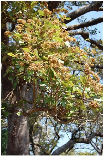
Parinaria curatellifolia Planchon ex Benth. Machote, north east of Moribane forest, woodland and margin of fields, E 33.40975961, S 19.60622499; UTM36-WGS84 542968.858,7832041.318; alt 550 m