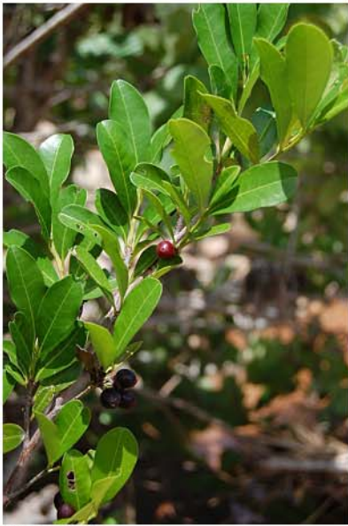
Mystroxylon aethiopicum Loes. (?) Chimanimani conservation area, miombo woodland vegetation in woodland close to the Mussapa pequeno river at the "portão"; E 33.08467816, S 19.58420245; UTM36-WGS84 508880.806,7834527.580; alt 600 m.