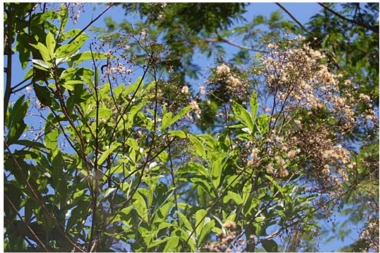
Vernonia polyanthes Less Moribane forest, along one of Monteiros plot, close to Nzou camp ; E 33.33537296, S 19.73334205; UTM36-WGS84, 535140.617,7817991.896 alt 550 m