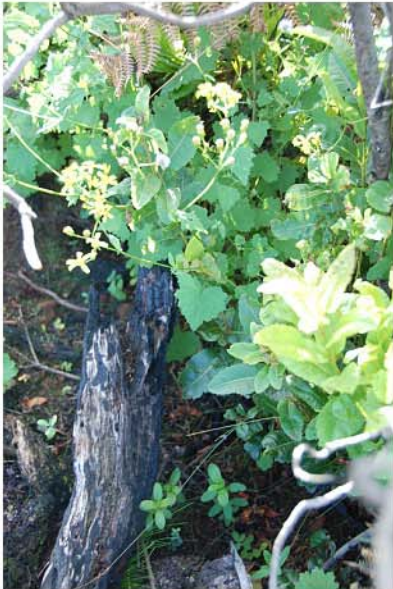
Senecio deltoideus Less. Mt Tsetsera, in grassland, E 32.84042651, S 19.39965706; UTM36-WGS84 483245.394,7854942.666; alt 1950 m