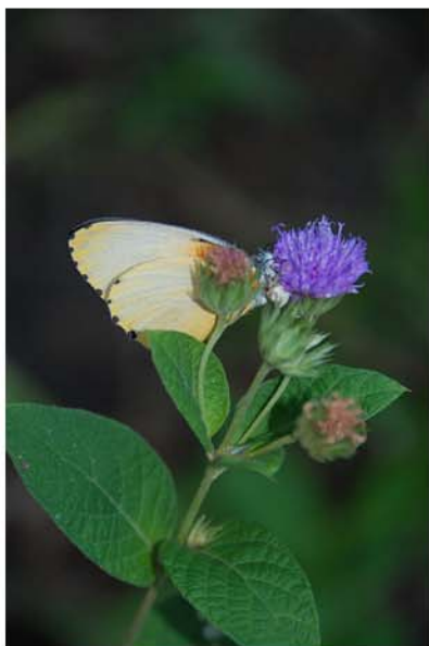
Vernonia sp. Buffer zone of Chimanimani reserve, in and around Mahate camp; E 33.19065242,-19.67441750, alt 500 m. The butterfly is dead and being eaten by a spider