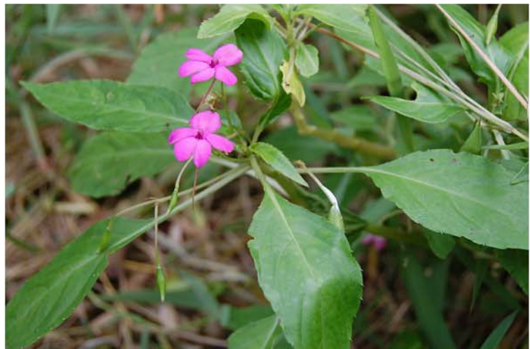
Impatiens wallerana Hook.f. Moribane forest, area of Chimokono, along path going and along Musuma river, above the waterfall, deforested/degraded forest vegetation; E 33.34711359, S 19.77777192; UTM36-WGS84 536360.75, 7813072.88; alt 400 m.