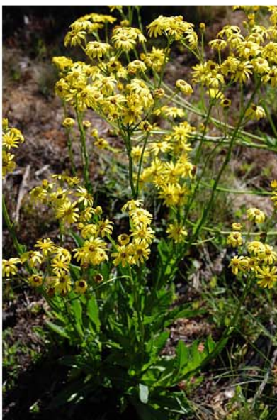
Senecio sp (?) Mt Tsetsera, grasslands towards the top of the plateau, E 32.79926601, S 19.38158055; UTM36-WGS84 478921.359,7856938.374; alt 2200 m