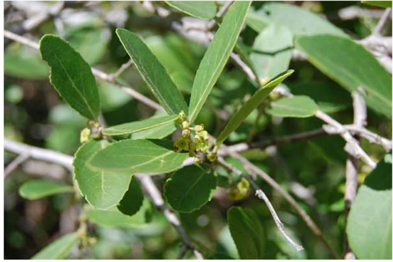
Mystroxylon aethiopicum Loes. (?) Chimanimani conservation area, miombo woodland vegetation in woodland close to the Mussapa pequeno river at the "portão"; E 33.08467816, S 19.58420245; UTM36-WGS84 508880.806,7834527.580; alt 600 m.