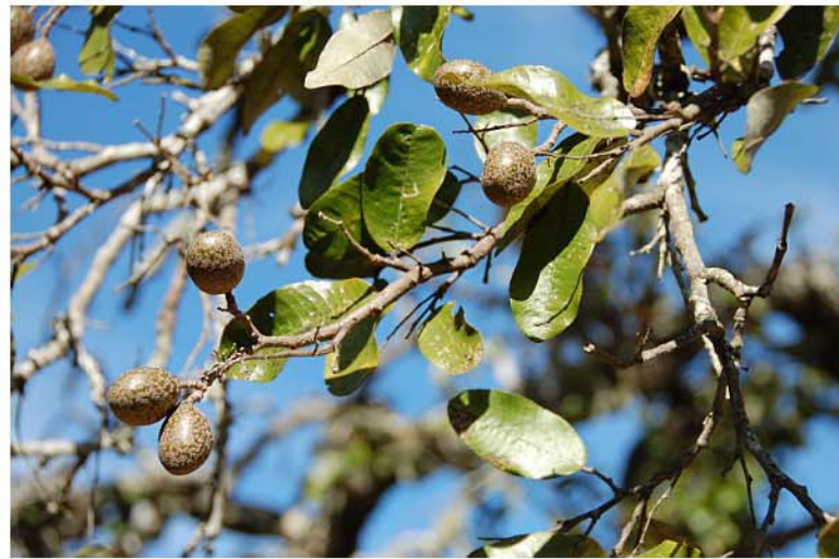
Parinaria curatellifolia Planchon ex Benth. Chimanimani mountains, along Nhamadzi river, around second time crossing the river; E 33.06, S 19.75m qlt; 1300 m